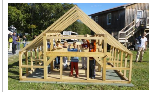
NBA barn model at Roxbury Farm CSA Festival. See it at the National Trust Conference in Buffalo.

“The Barn Door” Newsletter of the National Barn Alliance 5580 N. Chippewa Rd, Coleman, MI 48618